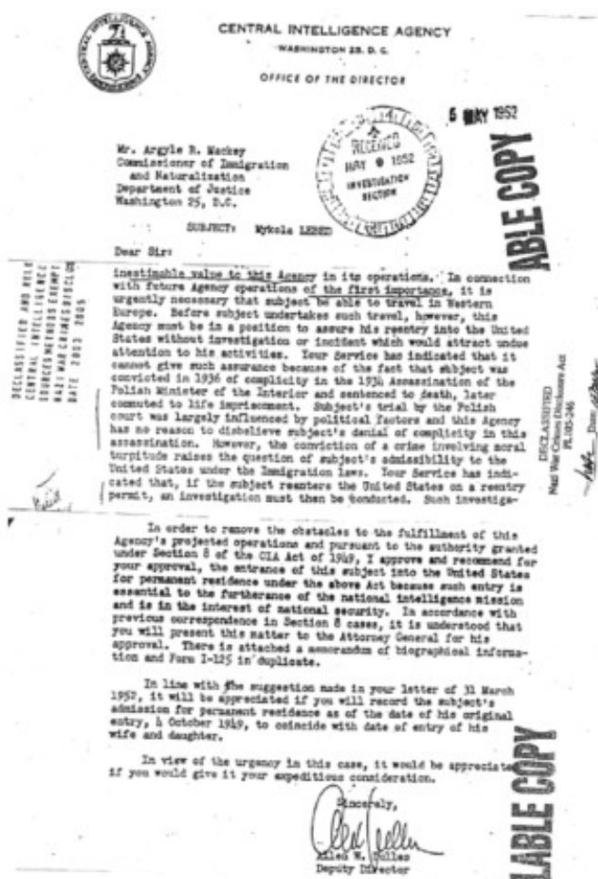
The CIA moved to protect Ukrainian nationalist leader Mykola Lebed from criminal investigation by the Immigration and Naturalization Service in 1952.

Lebed was the “foreign minister” of a Banderite government in exile, but he later broke with Bandera for acting as a dictator. The U.S. Army Counterintelligence Corps termed Bandera “extremely dangerous” yet said he was “looked upon as the spiritual and national hero of all Ukrainians....”