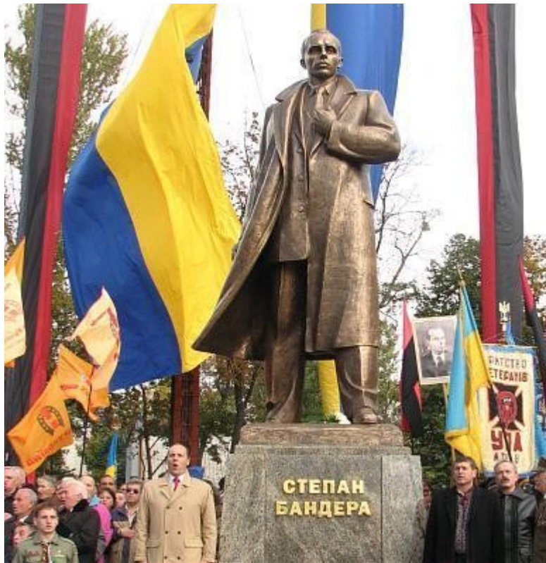
Bandera monument in Lvov.

The U.S. thus covertly kept Ukrainian fascist ideas alive inside Ukraine until at least Ukrainian independence was achieved.